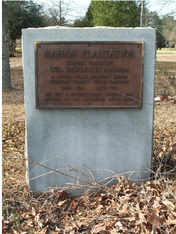
Bronze marker located near the intersection of Colonel Maham Drive and Westfield Drive, on right when traveling west on Colonel Maham Drive toward SC Highway 45 33° 25.996' N – 80° 01.110' W