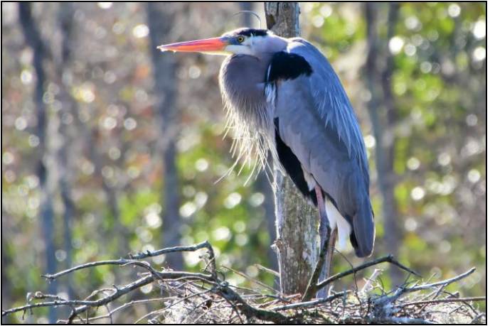
Nesting Great Blue Heron in early Spring at The Jungle.