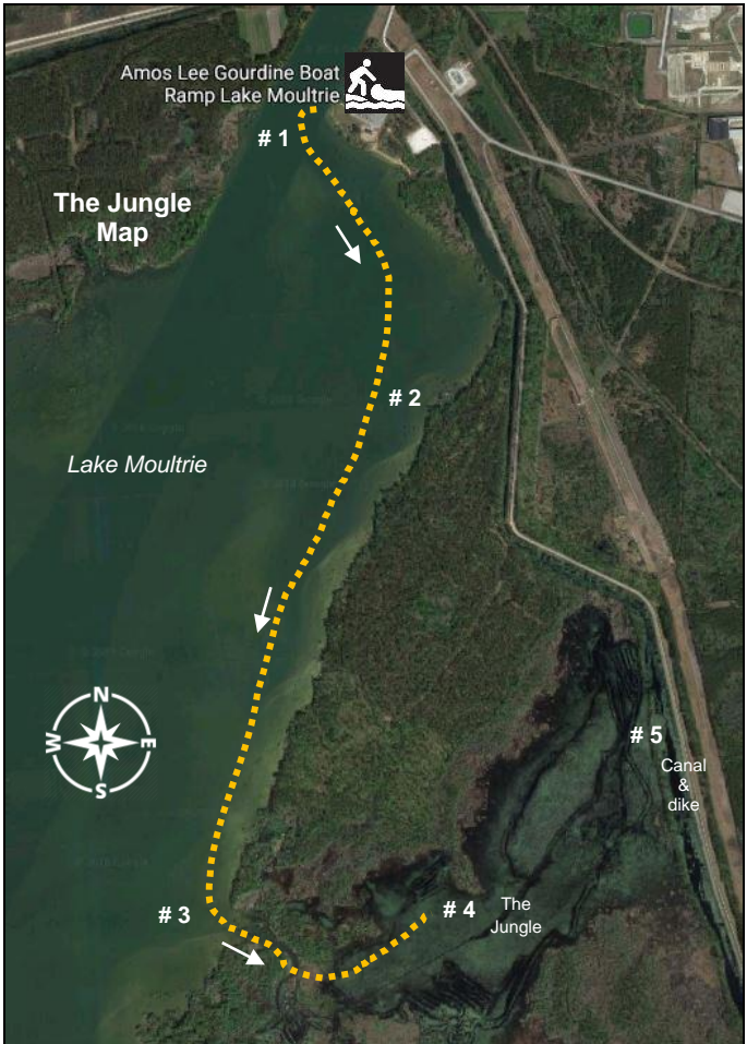
This map corresponds with route directions numbered 1 - 5 on page 6.