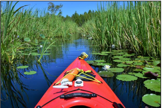
The narrow, interesting paths of The Jungle.