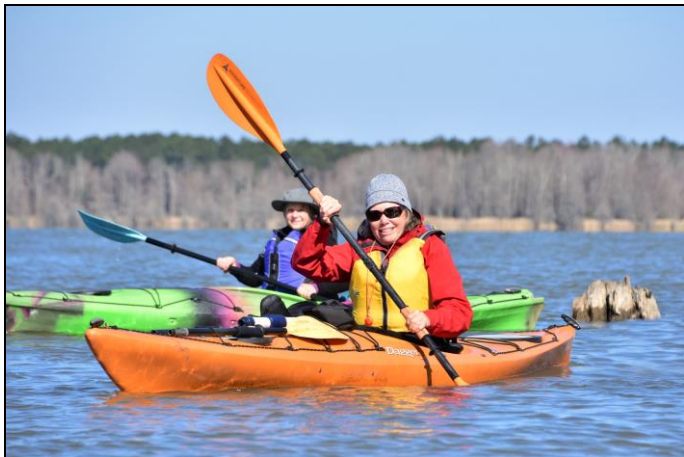
Crossing the open water from the boat ramp to The Jungle entrance.