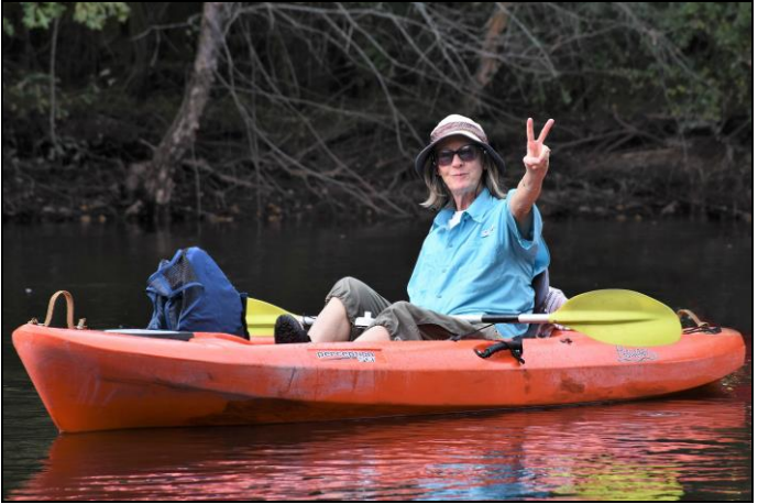
Want a peaceful paddle? There's no stress on Wambaw Creek! Note: Wearing a PFD (life jacket) is always recommended.