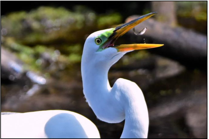
Great Egret snagging some lunch on Wambaw Creek.