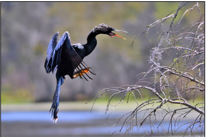
Male Anhinga near Sandy Beach on North Lake Moultrie.