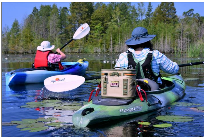
Paddling North Lake Moultrie to Sandy Beach.

Summary The 600-acre Sandy Beach Waterfowl Refuge includes part of North Lake Moultrie. It is a protected waterfowl management area with a nice beach for primitive camping. This entire area is beautiful with tupelos, flowing aquatic plants and you're almost guaranteed to see a few large birds of prey. There are hiking trails open from March 1 until November 1.