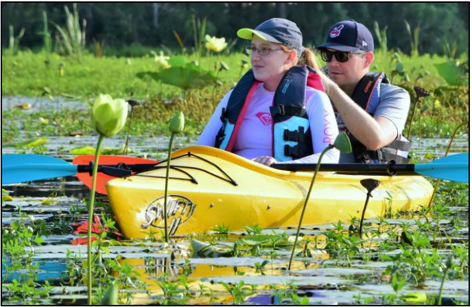
There's lots to see on the eastern shore of Lake Moultrie on this paddle.