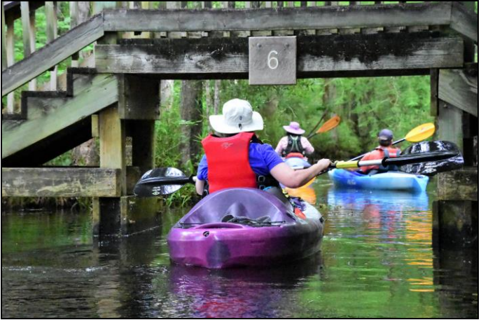
Paddling under one of the bridges on Biggin Creek.