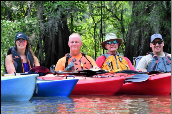
Old Santee Canal Park is a great place for large groups of paddlers.