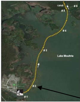
Map 1 of 2 - Santee Canal N. Moultrie

This map corresponds with route directions numbered 1 - 5, and 8.