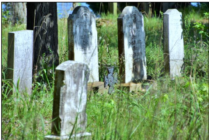
There's centuries' old history on Church Island.