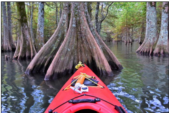
There are acres of cypress trees near the banks of Church Island.