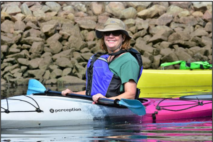
At the Rembert C. Dennis Landing. Heading out for some fun!