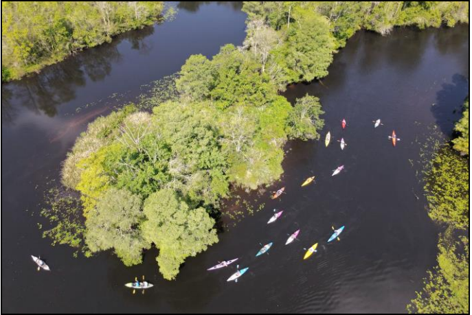
Aerial view of kayaks on Lower Wadboo Creek.