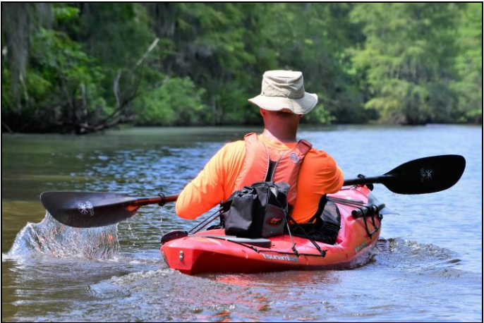
The Santee River shoreline has lots of willows and hanging moss.