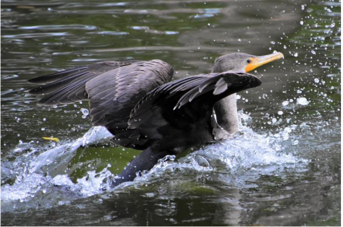
You'll see lots of large waterfowl like this Cormorant on the Santee River.