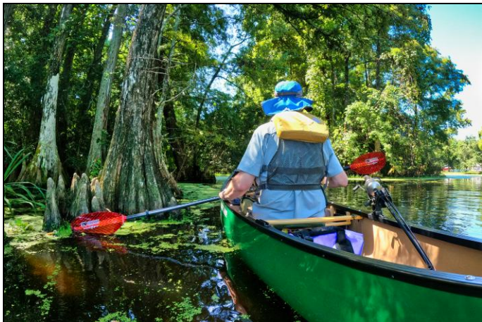
There are many small tributaries and coves on Goose Creek Reservoir.