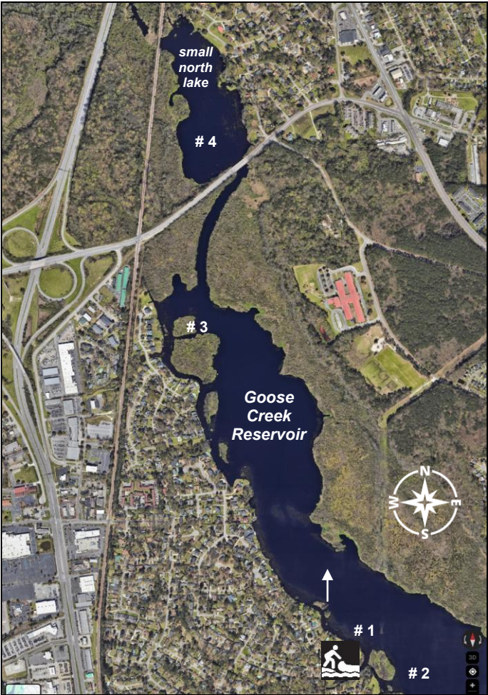
This map corresponds with route directions numbered 1 - 4 on page 6.