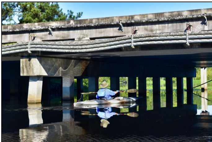
Paddling under the Goose Creek Road bridge to access the small north lake.