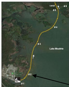
Map 1 of 2 - Santee Canal N. Moultrie

This map corresponds with route directions numbered 1 - 5, and 8.