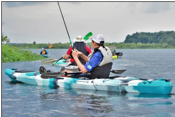
Kayak fishing is fantastic at Goose Creek Reservoir.