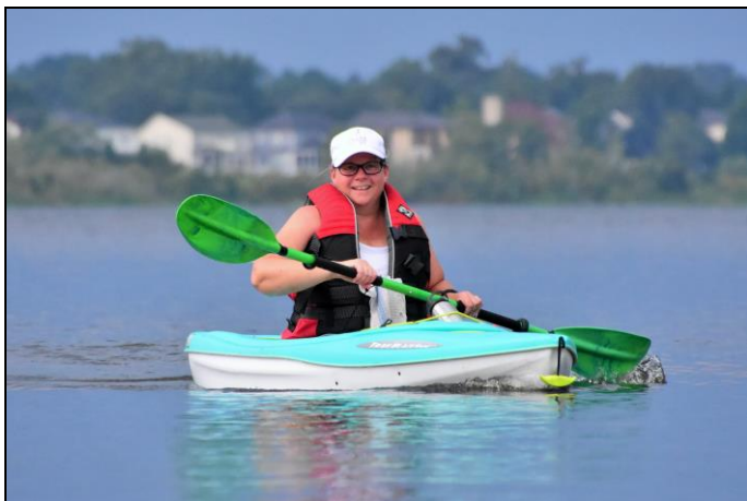
It's easy family fun on Goose Creek Reservoir.