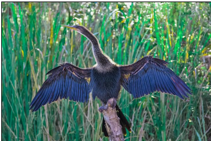
Sunning Anhinga at Goose Creek Reservoir. You'll see lots of these birds.