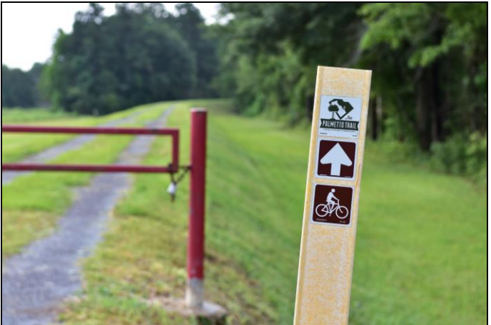
This is part of the Palmetto Trail's Lake Moultrie Passage.