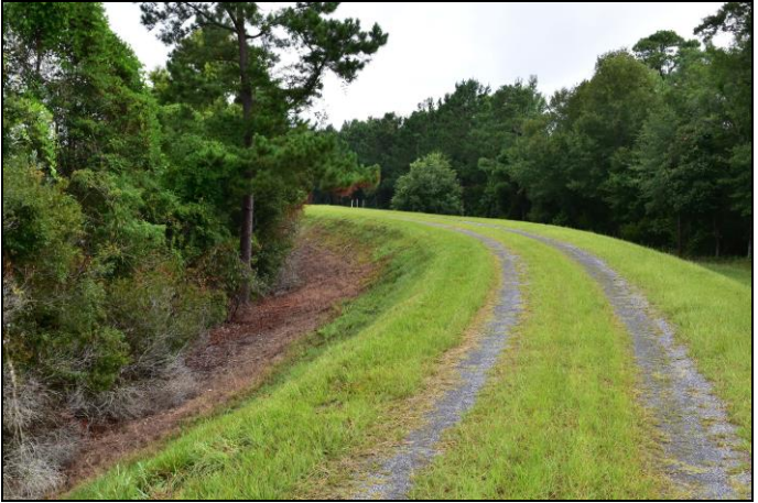
95% of this hike is on the service road atop the Lake Moultrie dike.