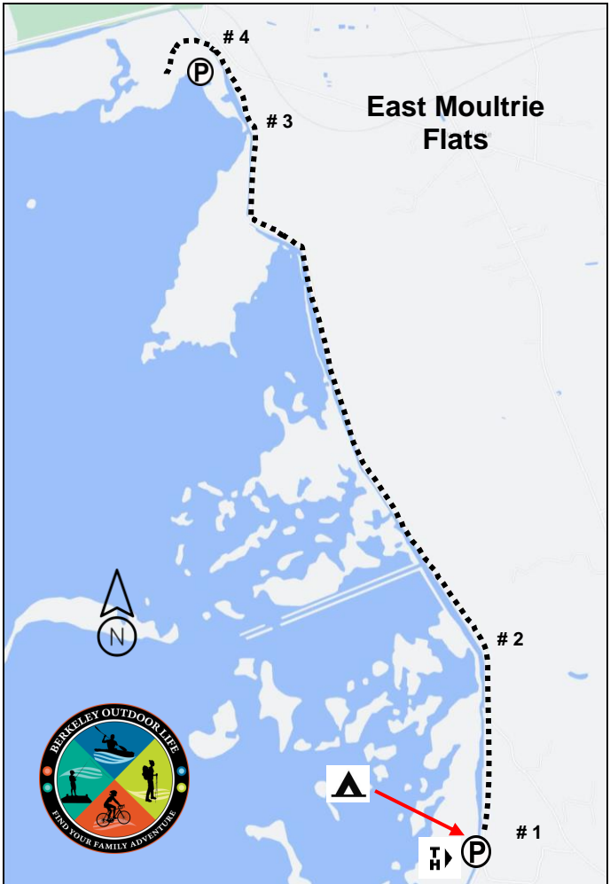
This map corresponds with route directions numbered 1 - 4 on the next page.