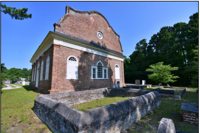
You'll visit St. Stephen Episcopal Church that dates to the 1760s.