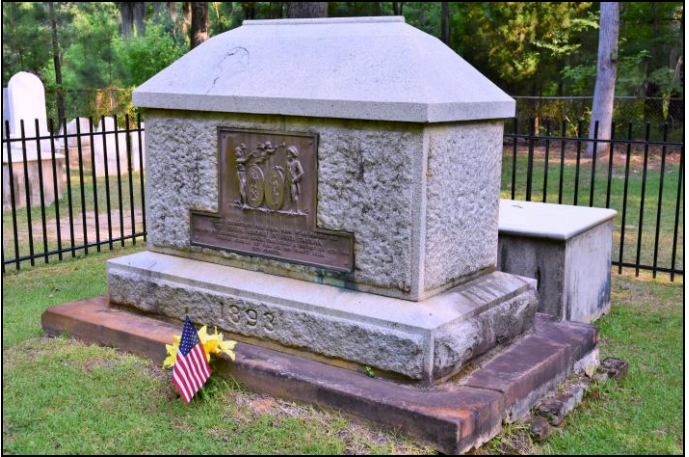
Tomb of Revolutionary War hero Francis Marion.