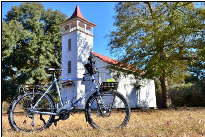
Bikes & History! At historic Pineville Chapel, circa 1810.