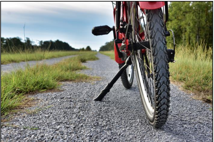
The riding surface is small gravel; smooth and fast!