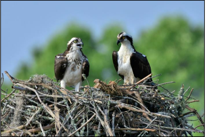
Osprey pairs are a common sight on Lake Moultrie for over the year.