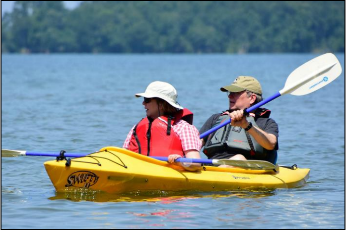
You'll paddle across open water to get to Coon Island, but it's easy!